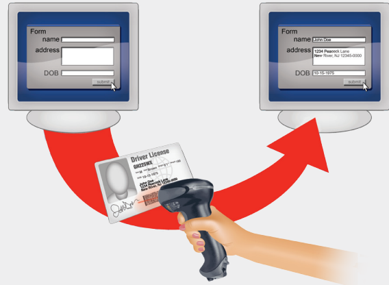
Automatically populate electronic forms in a single scan